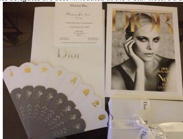
In the hotel room, Dior prepared gifts and invitations to the couture show.