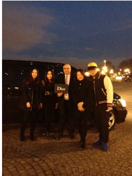
Raffles students and lecturers are greeted by a Dior executive at the airport.