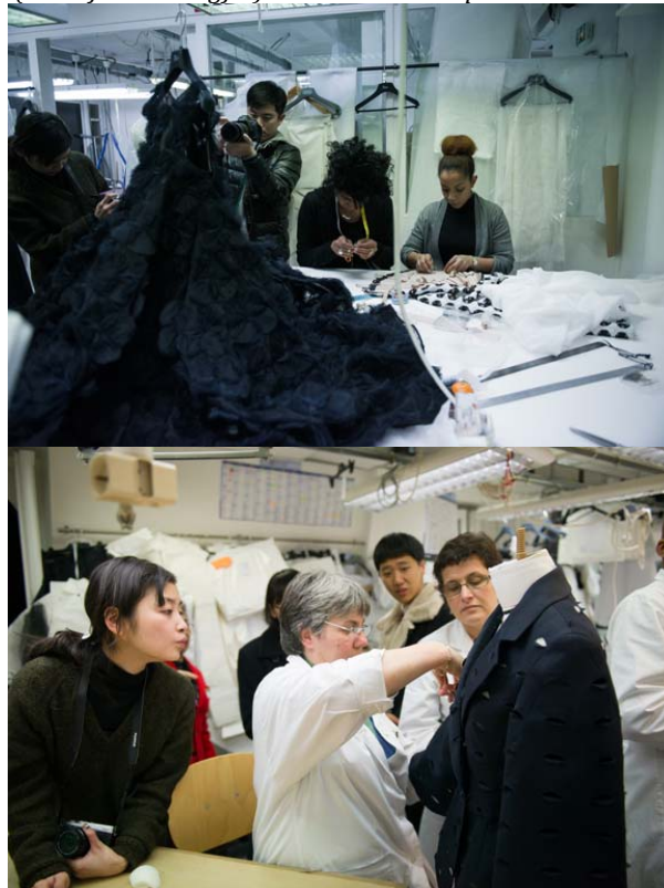
Students visit the mansion's ateliers to take a closer look at the making of garments for Dior Couture 2014SS collection.