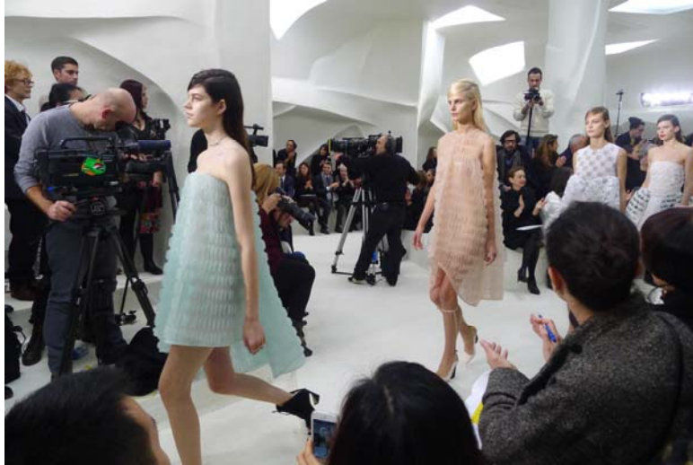
Dior Couture 2014SS