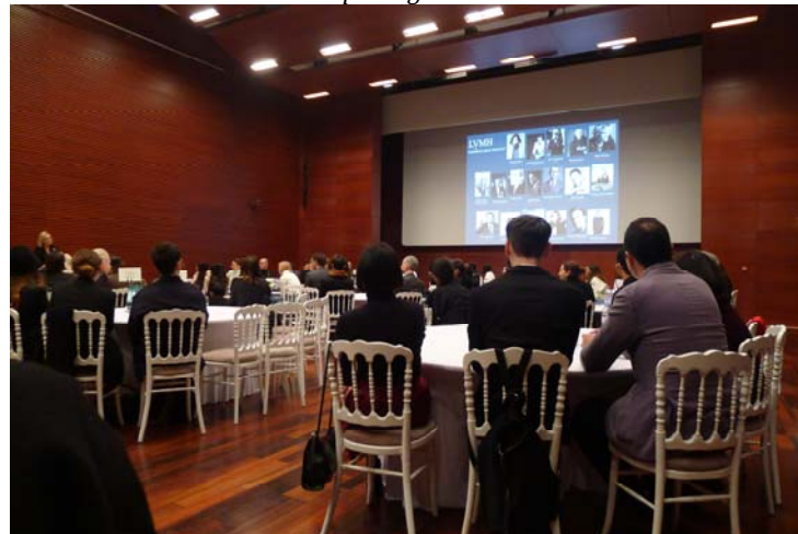
Designers from LVMH houses share their experiences on the future of fashion.