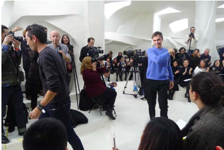
The audience applauds Raf Simons as he makes his exit at the end of the show.