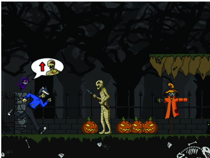
Screen-shot of Hypo-googia! Flash Game Ian Ho Zhi Yang